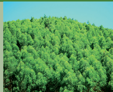
Renewable eucalyptus plantations grown in Brazil for the leading global producer of bleached eucalyptus pulp

Sources: Paper Task Force, 1995; Markets Initiative website ( www.marketsinitiative.org ) (5/09/07).